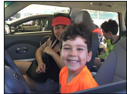
A future PEV driver enjoys a Kia Sol PEV.