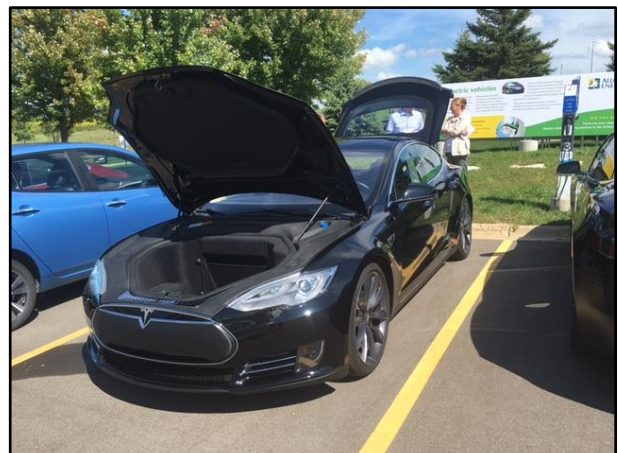
Madison, Wisconsin National Drive Electric Week 2016

Charging Station Incentive: Alliant Energy is offering a $500 rebate when for purchasing a level 2 home charger between January 1, 2017 and December 31, 2017. 4