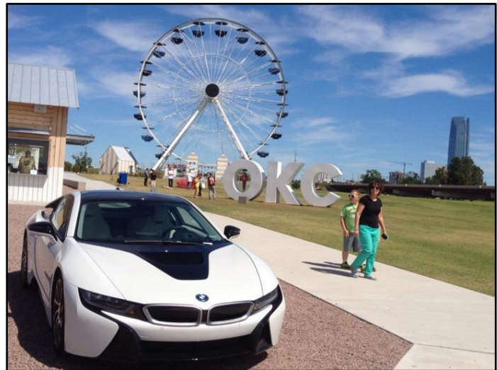
Oklahoma City, Oklahoma National Drive Electric Week 2016

Other: OK Insurance companies may offer discounts on PEVs.