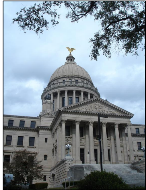
Mississippi State Capitol Building, Jackson Mississippi.

Other: MS Insurance companies may offer discounts on PEVs.