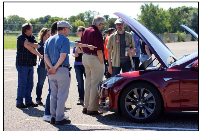
Bloomington, Minnesota National Drive Electric Week 2015

Other: MN Insurance companies may offer discounts on PEVs.