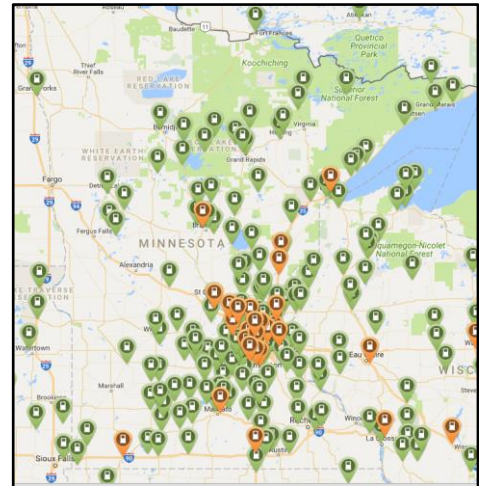
Current public charging stations available to all Minnesota drivers.