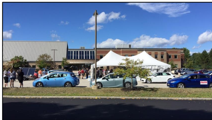
South Portland, Maine National Drive Electric Week 2016

Other: ME Insurance companies may offer discounts on PEVs.