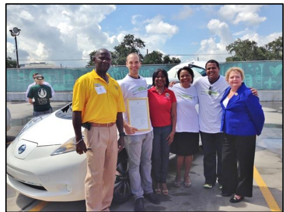
New Orleans, Louisiana National Drive Electric Week 2016

Other: LA Insurance companies may offer discounts on PEVs.