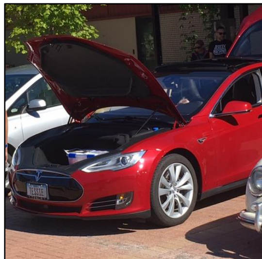
Cedar Rapids, Iowa National Drive Electric Week 2016

Other: IA Insurance companies may offer discounts on PEVs.