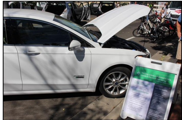
Boise, Idaho National Drive Electric Week 2016

Other: ID Insurance companies may offer discounts on PEVs.