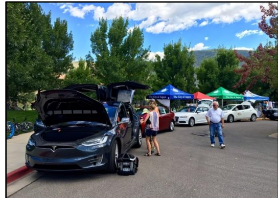
Aspen, Colorado National Drive Electric Week 2016

Other: CO Insurance companies may offer discounts on PEVs.