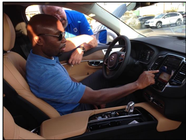
Little Rock, Arkansas National Drive Electric Week 2016