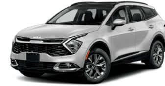
Kia Sportage Plug-In Hybrid $39,590 34 / 430 electric total miles