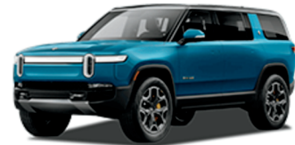
Rivian R1S $74,900 260-390 miles