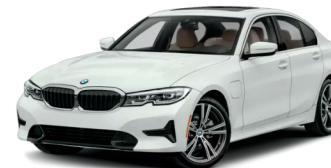
BMW 330e $45,600 22 / 320 electric total miles