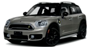
Mini Countryman SE All4 $38,900 12 / 270 electric total miles