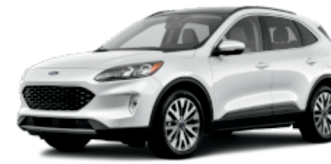
Ford Escape PHEV $40,500 37 / 520 electric total miles