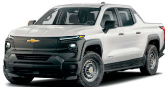
Chevrolet Silverado EV $94,500 440 miles

Find more all-electric vehicles at PlugStar.com