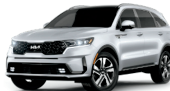
Kia Sorento Plug-In $50,290 32 / 460 electric total miles