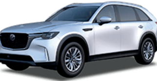
Mazda CX-90 $49,945 26 / 490 electric total miles