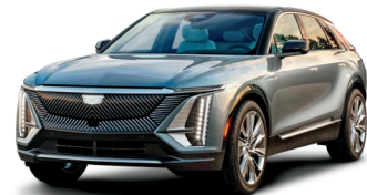
Cadillac Lyriq $57,195 314 miles