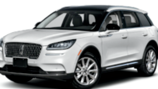
Lincoln Corsair Grand Touring $54,025 28 / 430 electric total miles

Find more plug-in hybrids at PlugStar.com