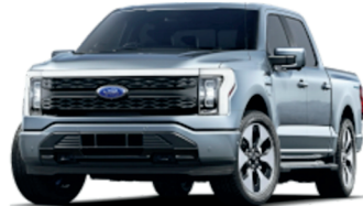
Ford F-150 Lightning $54,995 230-320 miles