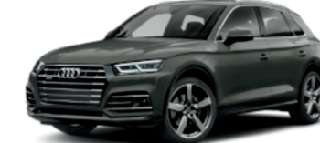
Audi Q5 PHEV $45,300 25 / 390 electric total miles