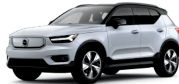
Volvo XC40 Recharge $52,450 226 miles