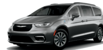
Chrysler Pacifica Hybrid $51,055 32 / 520 electric total miles