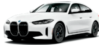
BMW i4 $52,200 227-301 miles