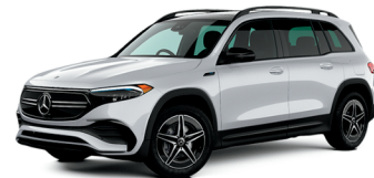
Mercedes-Benz EQB $53,050 245 miles