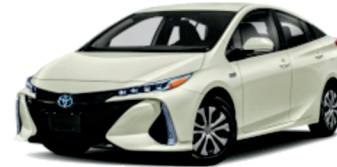
Toyota Prius Prime $32,975 39 / 600 electric total miles