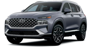
Hyundai Santa Fe Plug-In Hybrid $42,410 36 / 440 electric total miles