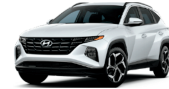
Hyundai Tucson Plug-In Hybrid $38,725 33 / 420 electric total miles