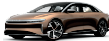
Lucid Air $69,900 411-520 miles