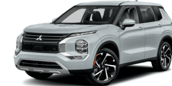
Mitsubishi Outlander PHEV $40,345 38 / 420 electric total miles