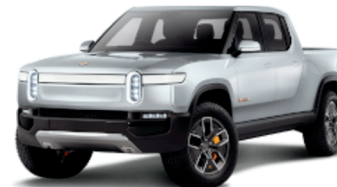
Rivian R1T $69,900 270-400 miles