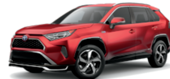
Toyota RAV4 Prime $43,690 42 / 600 electric total miles