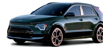
Kia Niro PHEV $34,390 31 / 510 electric total miles