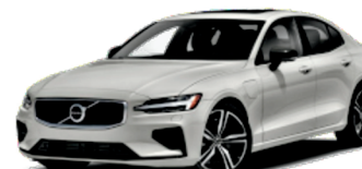
Volvo S60 Recharge $51,950 41 / 530 electric total miles